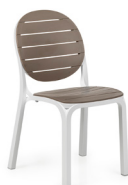
BIANCO TORTORA 40236.00.010